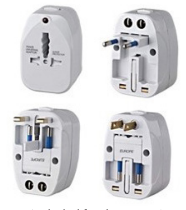
*Adapters included for the countries